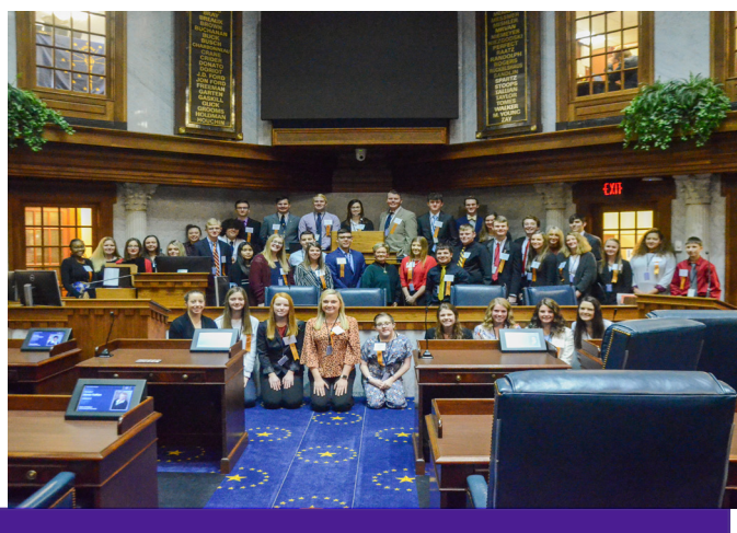
2019 Page Day Participants at the Indiana Statehouse