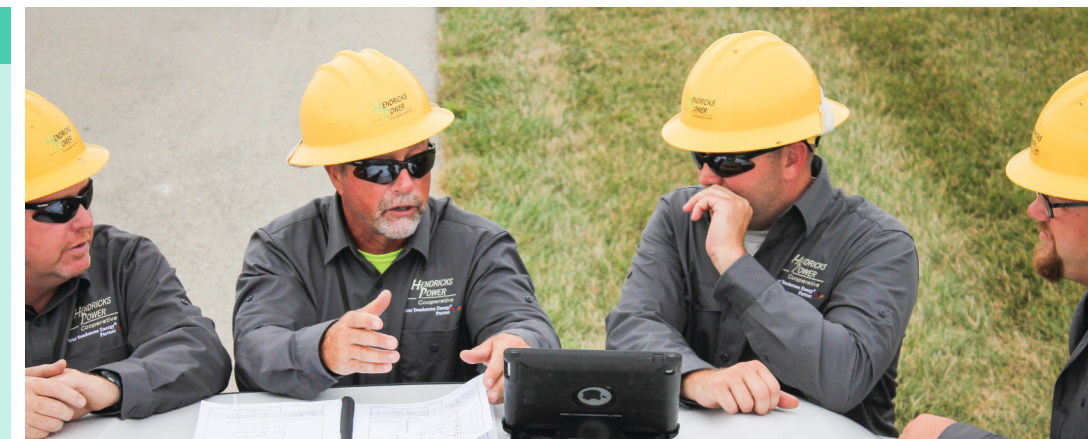
LINEWORKER APPRECIATION DAY

For a list of opportunities to meet the Easter Bunny and hunt for Easter eggs, go to visithendrickscounty.com .