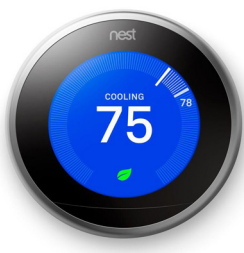
Nest Learning Thermostat