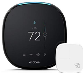
ecobee Smart Thermostat

Beginning on January 1st, we will be offering a $50 bill credit on a purchase of a smart thermostat. Below are some suggestions from our Energy Advisors. If you have any questions about which smart thermostat is right for your house (they’re not all created equal!), feel free to schedule an energy audit or give us a call at (317) 745-5473. For full information on this rebate, visit our website at www.hendrickspower.com.