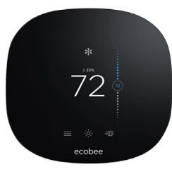
ecobee 3 Lite