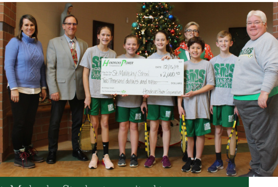
St. Malachy Students excited to use new athletic equipment.