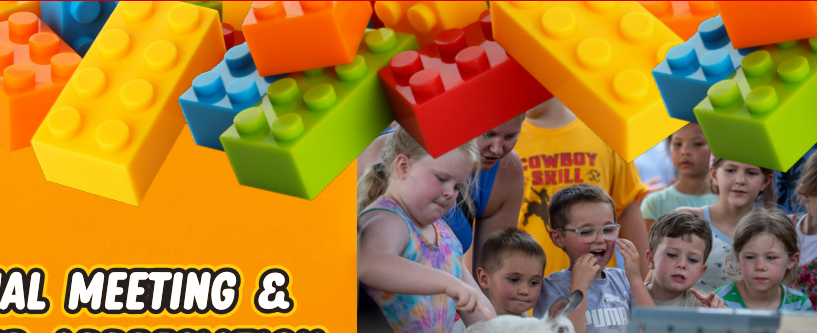
2025 Silly Safaris Animal Show