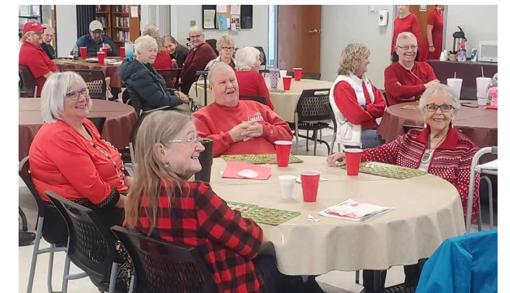
Senior Services guests enjoyed rounds of bingo and prizes hosted by Hendricks Power employee volunteers

To see all photos & dating advice, visit our Facebook page!